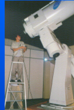
Sri Lanka 1996