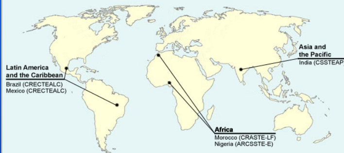
Regional Centres for Space Science and Technology Education (affiliated to the United Nations)