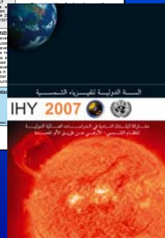
IHY Brochure (6 languages)