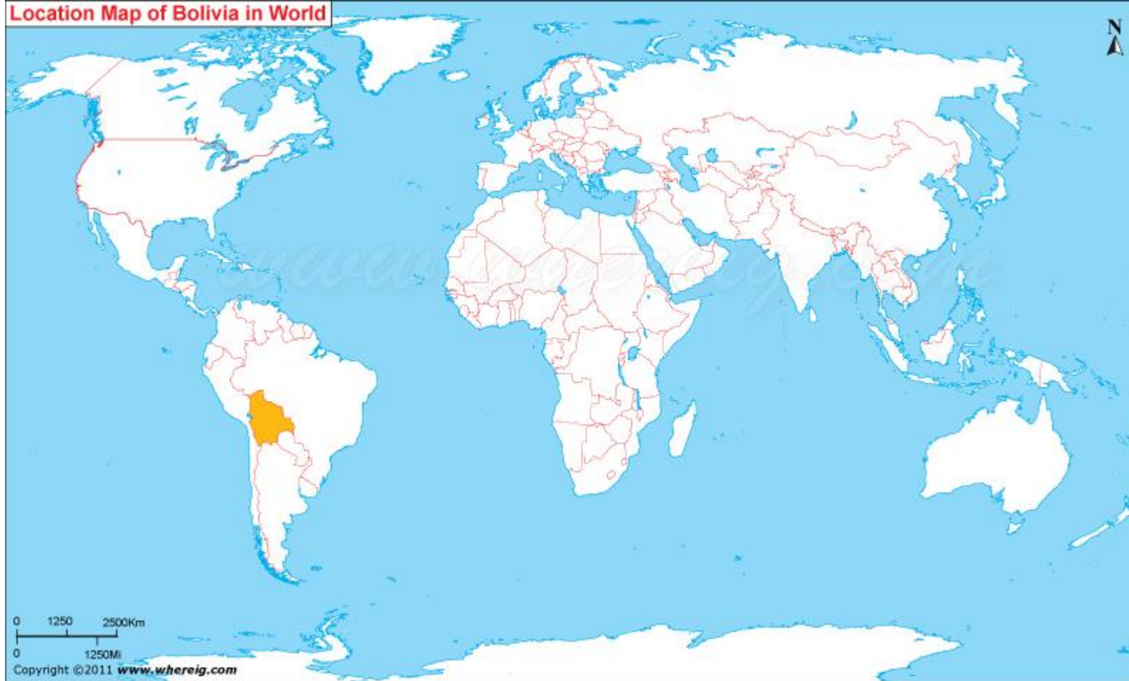
Location Map of Bolivia in World