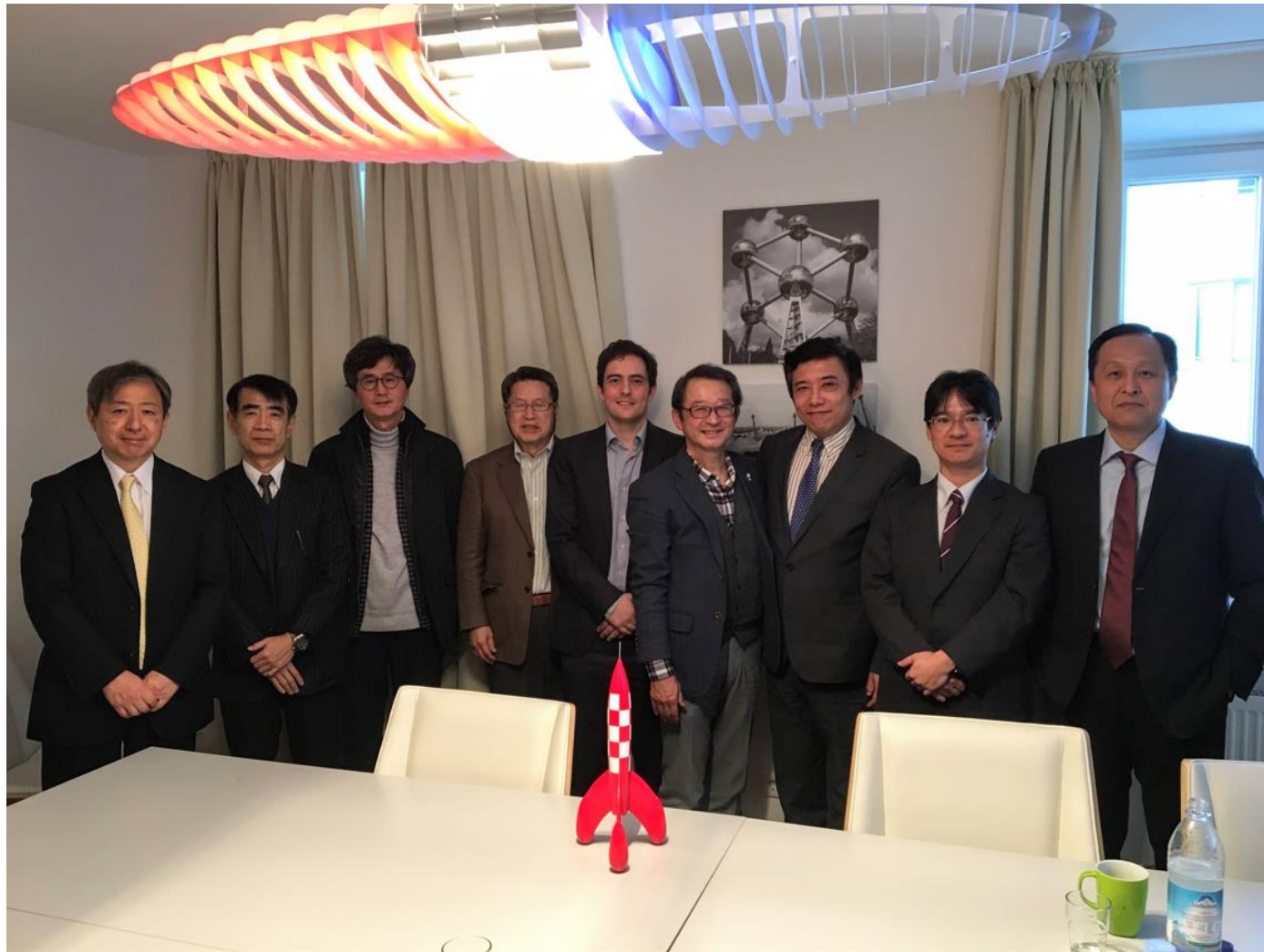
Participants from China, EU, Japan and Korea (invited)