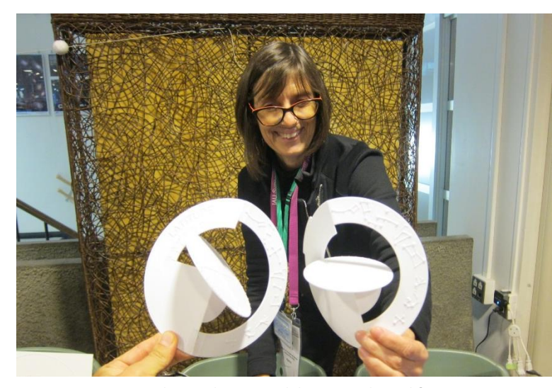
Inspiring Stars, Tactile Simulation Models in 3D, adapted from NASE Program, Japan, 2018.

The main difficulty is that any project needs staff and enough grant money to pay people involved in the development of new tools. This is especially hard because most of the grants available are devoted to very well-established lines of research.