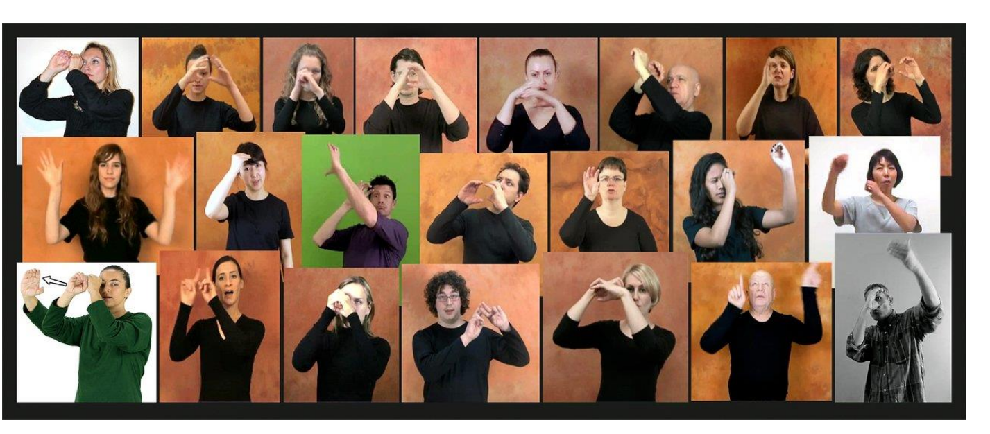
The term "astronomy" as represented in sign language in different countries.

At the same time, I will keep working in the field of Cosmology and especially on the QUBIC project. We are now in the testing phase of the instrument, which will probably take another 2 or 3 years to produce valuable results.