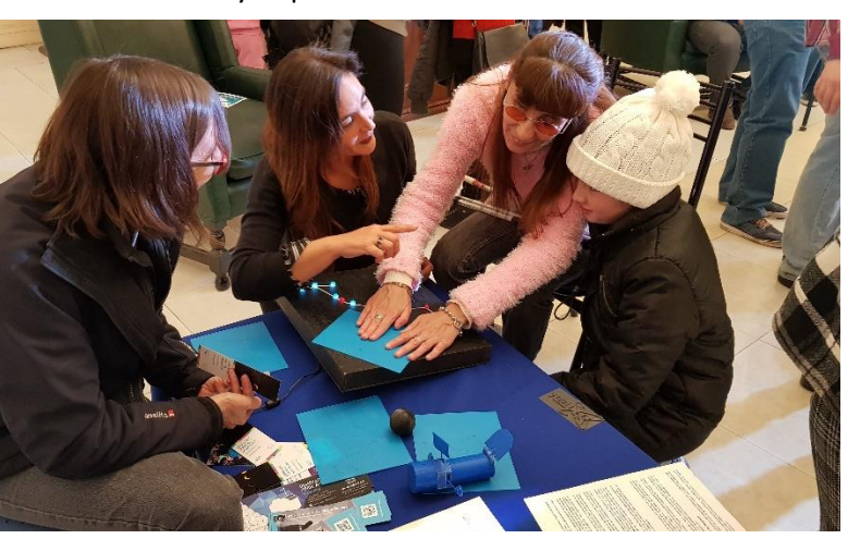
Working with tactile and thermal constellations, El Universo Invsisible exhibition, Mendoza, 2018.

After the tactile models, I started working with the sonification. Sonification means transforming an image into sound, or a set of data into sound, in order to make the analysis of the data, and then the research, more accessible for people who are visually impaired.