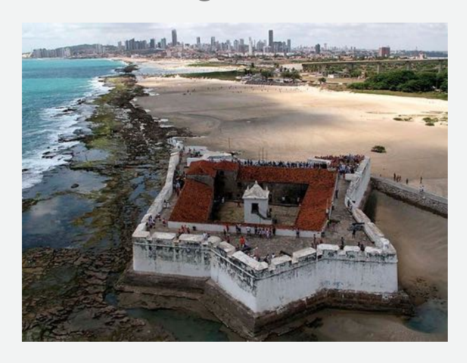
Reis Magos Fortress