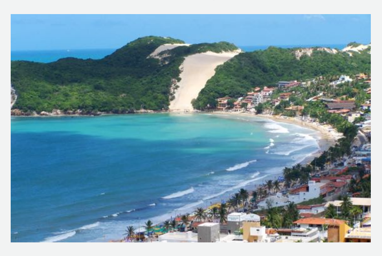
Morro do Careca