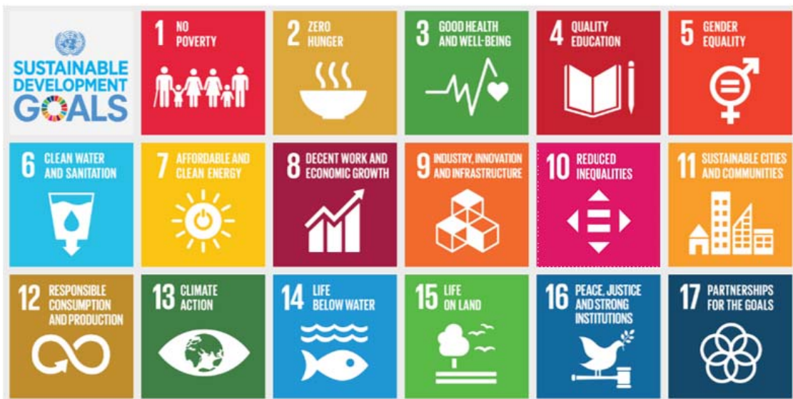
Figure 1. Sustainable Development Goals Accepted by the UN General Assembly

The mission of the United Nations Office for Outer Space Affairs (UNOOSA) is to promote international cooperation in the use of outer space to achieve development goals for the benefit of humankind. There is no better example of UNOOSA’s vision ‘to bring the benefits of space to humankind’ by showing space’s importance in the realization and implementation of the 17 Sustainable Development Goals (SDGs) shown in Figure 1.