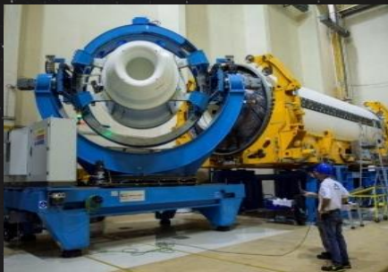
Main stage integration