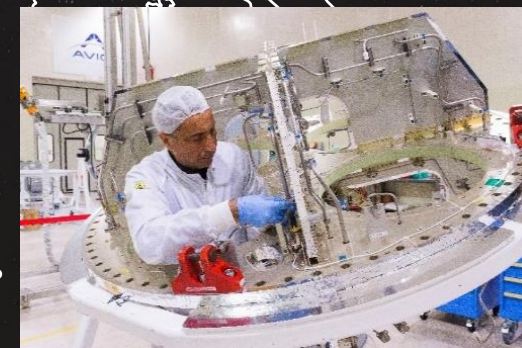
Upper stage integration