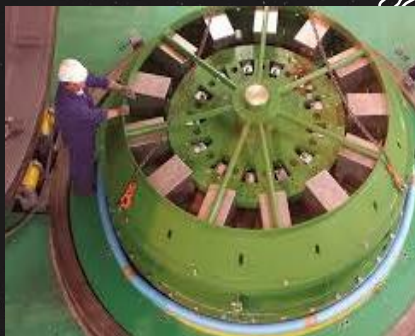
Propellant mft & casting