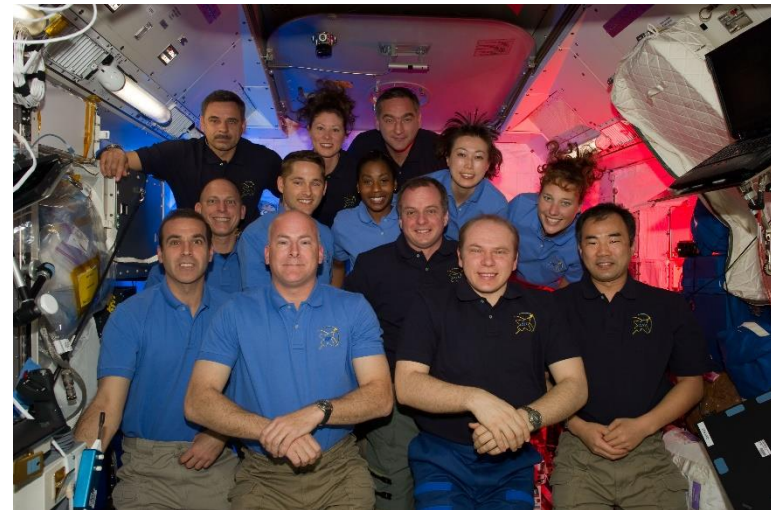
STS-131 and Expedition 23 crew members

in the use of outer space to achieve development goals