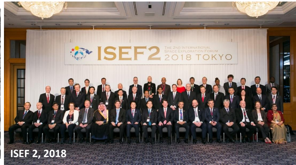
ISEF 2, 2018