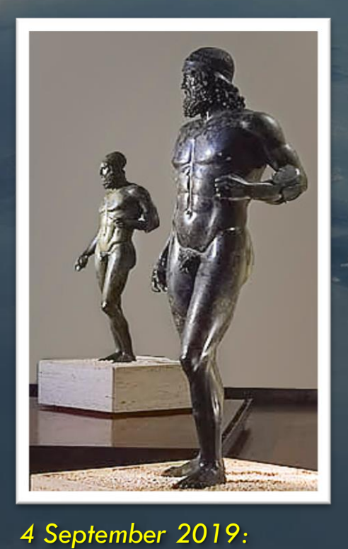
Guided tour of the Archaeological Museum of Reggio Calabria and a Welcome Reception