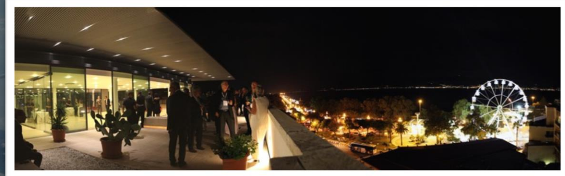
5 September 2019: Gala dinner