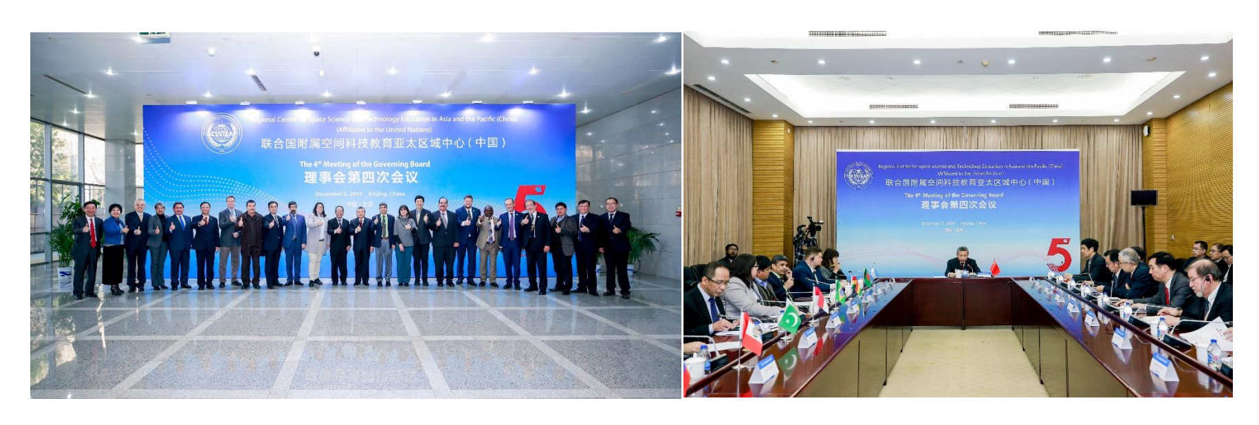
The 4<sup>th</sup> meeting of the Governing Board and the 5th Anniversary Celebration of RCSSTEAP (China) ( Dec. 9, 2019 )

1. ICG Information Centre: RCSSTEAP (China)