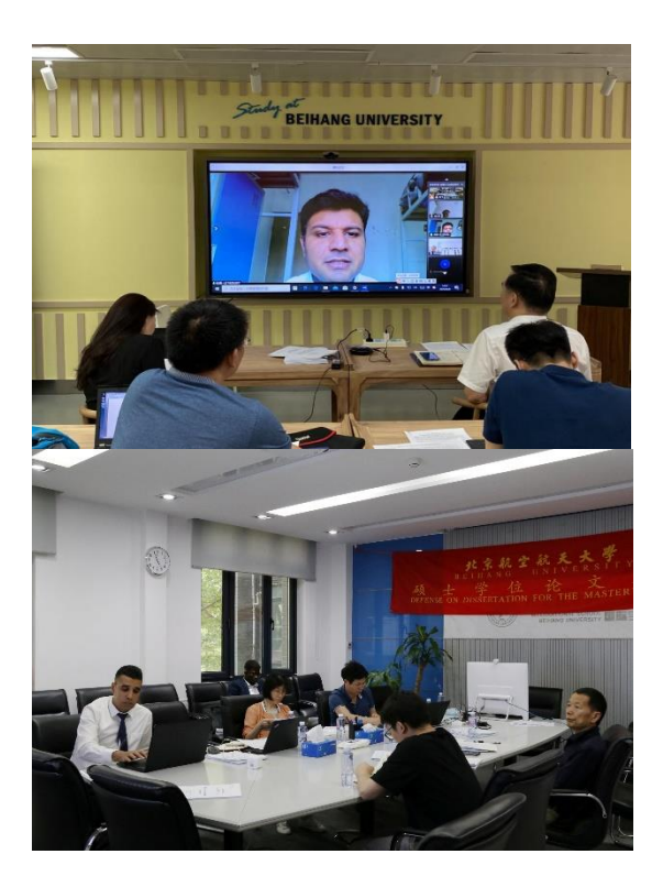
Online + Offline Defense