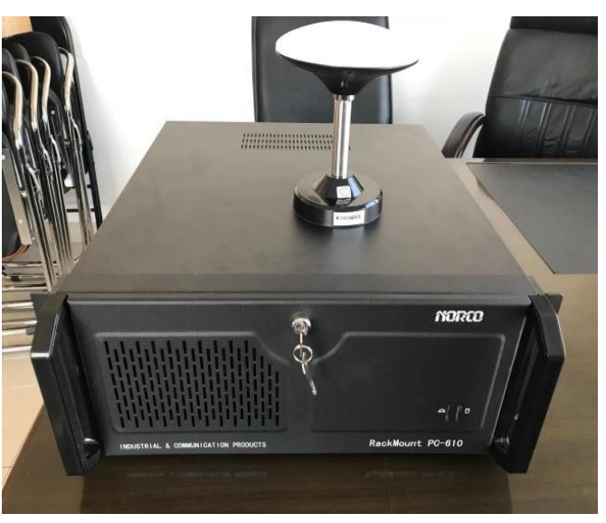
GNSS Signal Collector