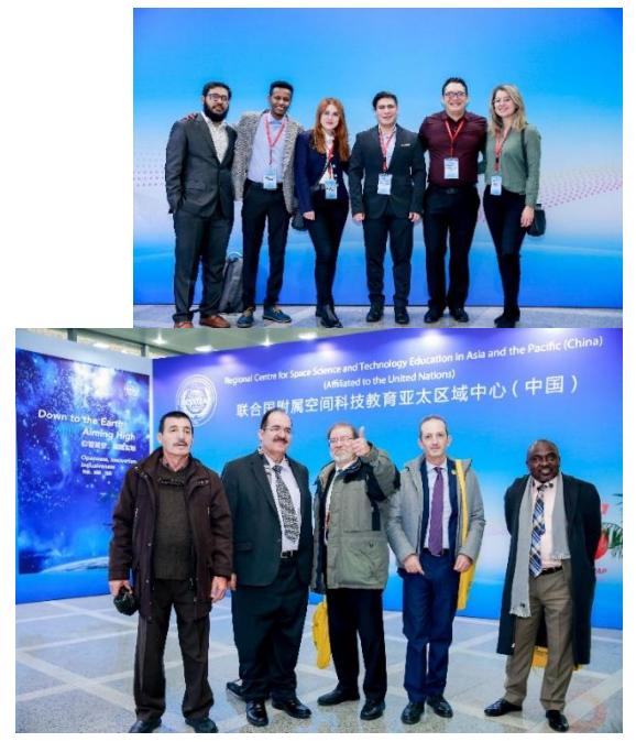
Participants: Representative of UNOOSA, Directors of the UN Regional Centres, China National Space Administration, Beihang University