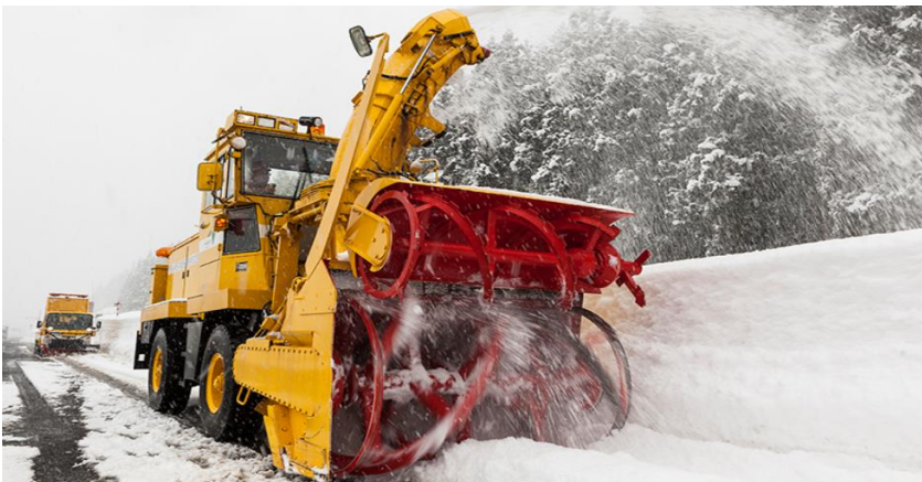
Snow blower operating to fit shapes of highway service area

Snow removal vehicles require highly experienced skill to the drivers and operators due to extremely poor visibility of outside and various controls to avoid damage to surrounding structures. For example, snow blower (rotary type) must run on road shoulders avoiding collision with guardrails and snowplow height must be adjusted no to hit bumps on the road covered by snow. In order to augment drivers' and operators' skill, voice guidance system which informs locations of such potentially dangerous points has been a provision based on vehicles GPS point positioning. However, the system requires two persons per vehicle. Snow blower needs one driver plus one operator who adjusts augers (rotational peddles) height and snow shooting direction, Snowplow needs one driver plus one operator who adjust plow height. In addition to the manpower and skill problems, aging of experienced drivers/operators and low birth rate are the social problems which must be resolved very quickly. Under these circumstances, NEXCO EAST Corporate Japan has been developing autonomous system of snow removal vehicles utilizing Michibiki's cm-level augmentation system, CLAS, since 2019, and know-how transformation from the experienced not to the inexperienced but to its control box is ongoing. The system will be in full operation by the end of March 2023. We must note that center line is always invisible for this application and thus it is quite different from autonomous cars.