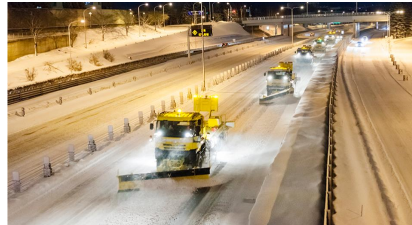
Snowplows controlling plow height to avoid collision with road joints