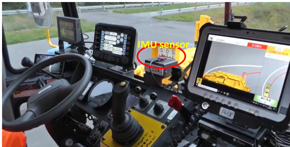
Inside of Snow Blower driver's car room