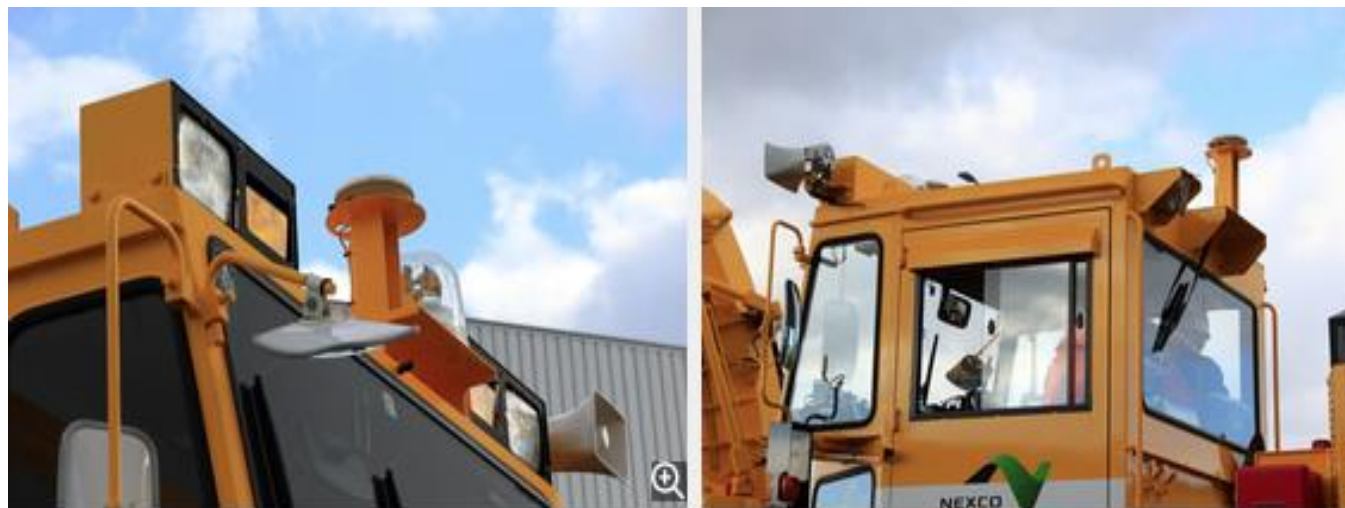
2 GNSS antennas mounted on roof of Snow Blower driver's car