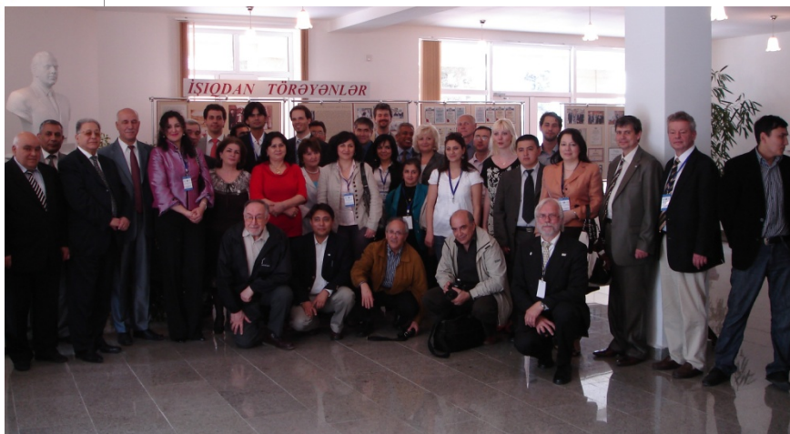
United Nations/Azerbaijan/European Space Agency/ United States of America Workshop on the Applications of Global Navigation Satellite Systems, 11-15 May 2009, Baku, Azerbaijan