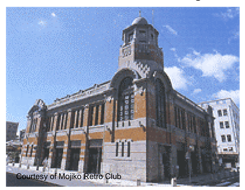
Old Mitsui O.S.K. Line Bldg.