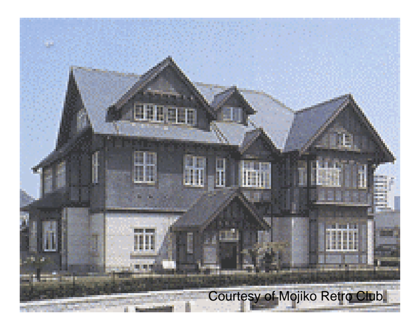
Old Moji Mitsui Club