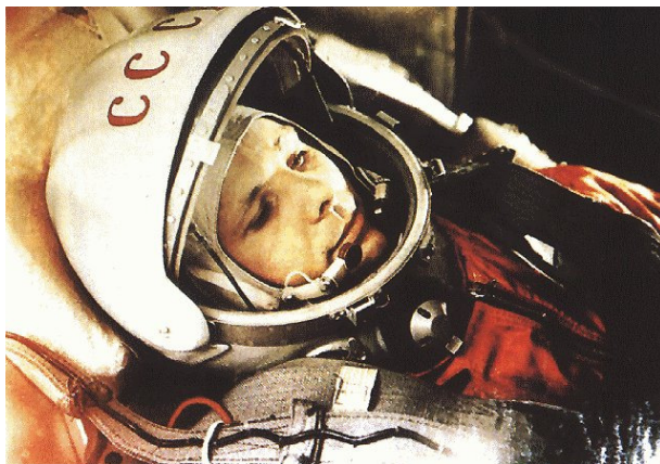
(Fig. 2) Yuri Gagarin (1961)