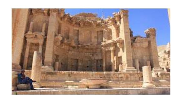
Dead Sea Petra Jarash