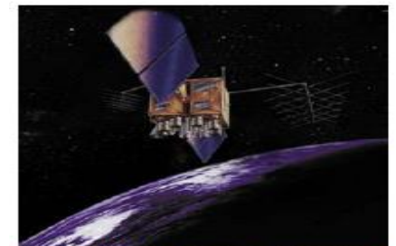
Block IIR/IIR-M Satellite – Designed & Built by Lockheed Martin