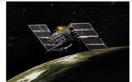
Block IIA Satellite – Designed & Built by Rockwell International