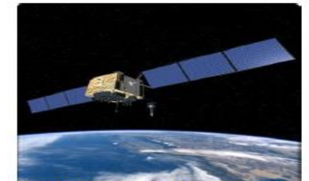
Block IIF Satellite – Designed & Built by Boeing