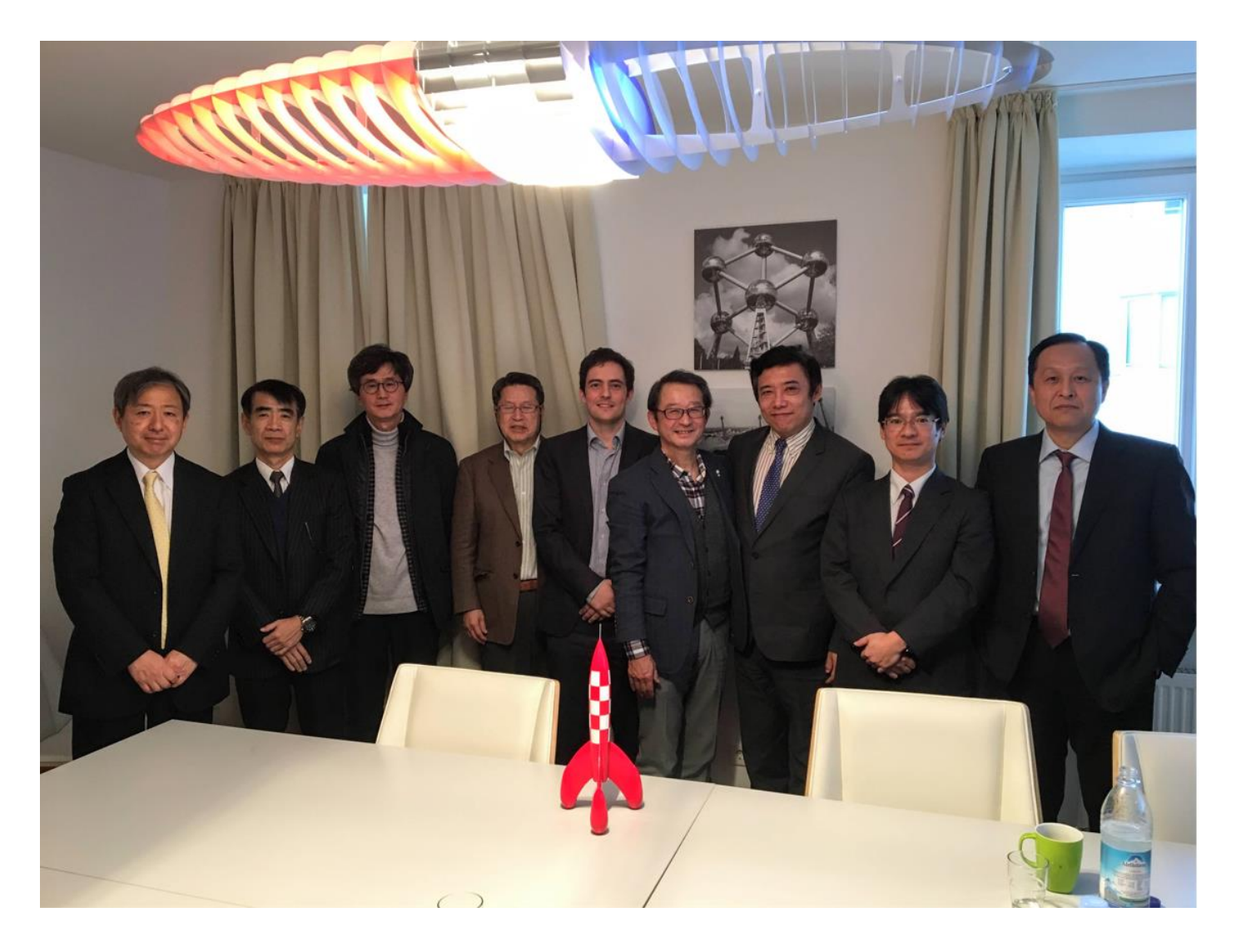
Participants from China, EU, Japan and Korea (invited)