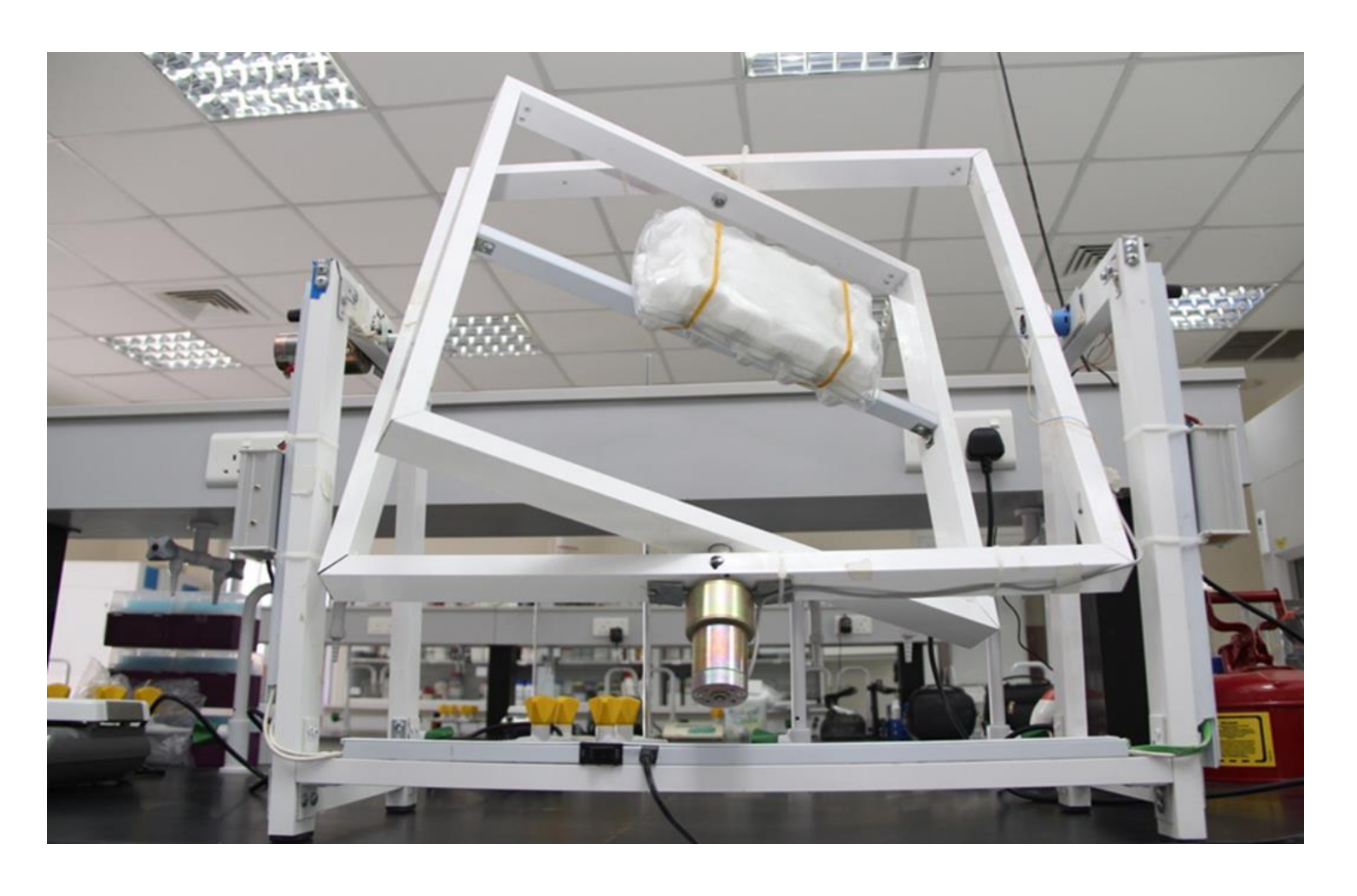
3D- Clinostat constructed at AUM