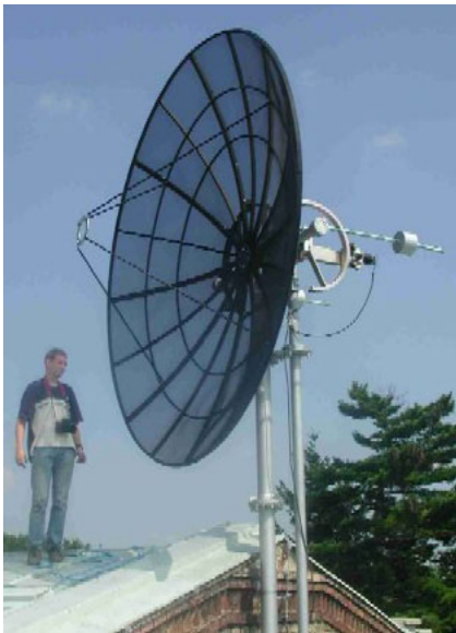
Figure 3 - The MOST Vienna ground station.

on a shoestring budget for people with a shoestring budget.