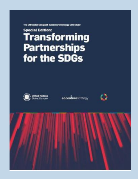
Transforming Partnerships for the SDGs