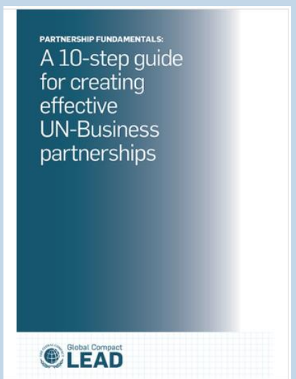
A 10-step guide for creating effective UN-Business partnerships