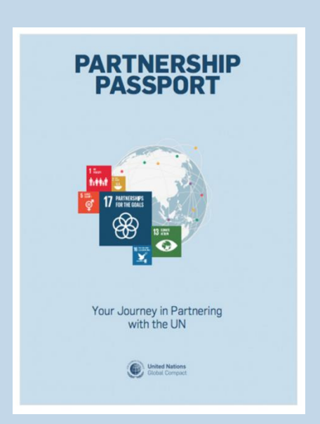
The Partnership Passport