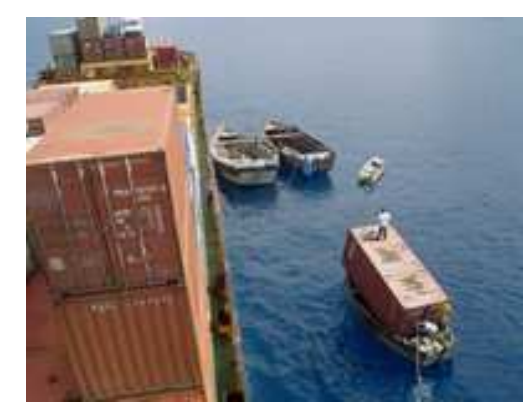
One ship can bring as many as 19,000 6m containers