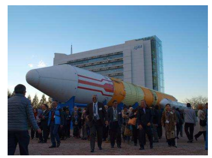
Technical Tours to JAXA space center