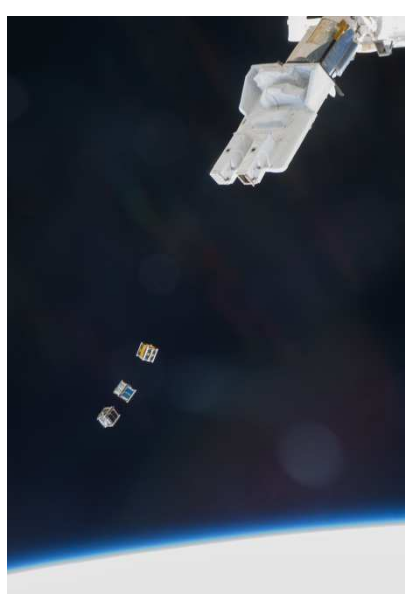
Cubesats of US and Vietnam Deployed in 2013