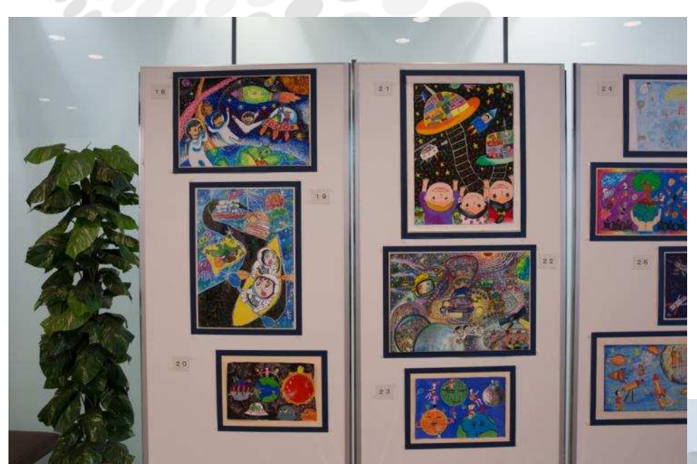
9<sup>th</sup> Poster Contest for Children