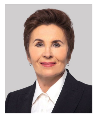
Dr. Olga Revia

- Former Moroccan Minister of Foreign Affairs, Minister of Finance and the Economy, and Minister of Finance and the Economy