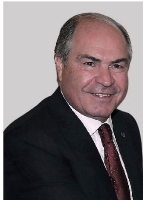
H.E. Dr. Hani Al-Mulki