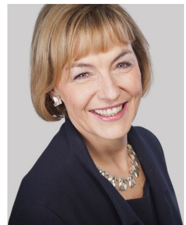
Dr. Vesna Pusić

- President & CEO of the Global Reach Co. LTD - Journalist, - World-renowned photographer - Honorary Principle of the Beijing School of the Deaf